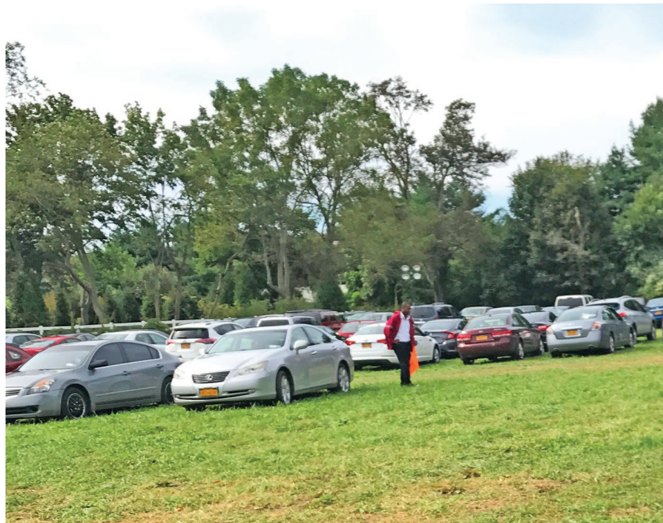
Parking Field B