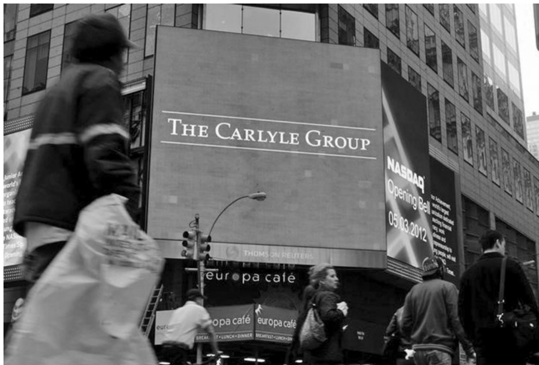
Passersby walk in front of video monitors announcing the Carlyle Group's listing on the NASDAQ market site in New York's Times Square after the opening bell for trading, U.S. May 3, 2012.

This is all speculation, however; nothing is set in stone. Art direction, amount of clothing produced and line-up formation may all change. But until then, Lafayette Street in Manhattan and now Grand Street in Brooklyn will still be just as crowded.