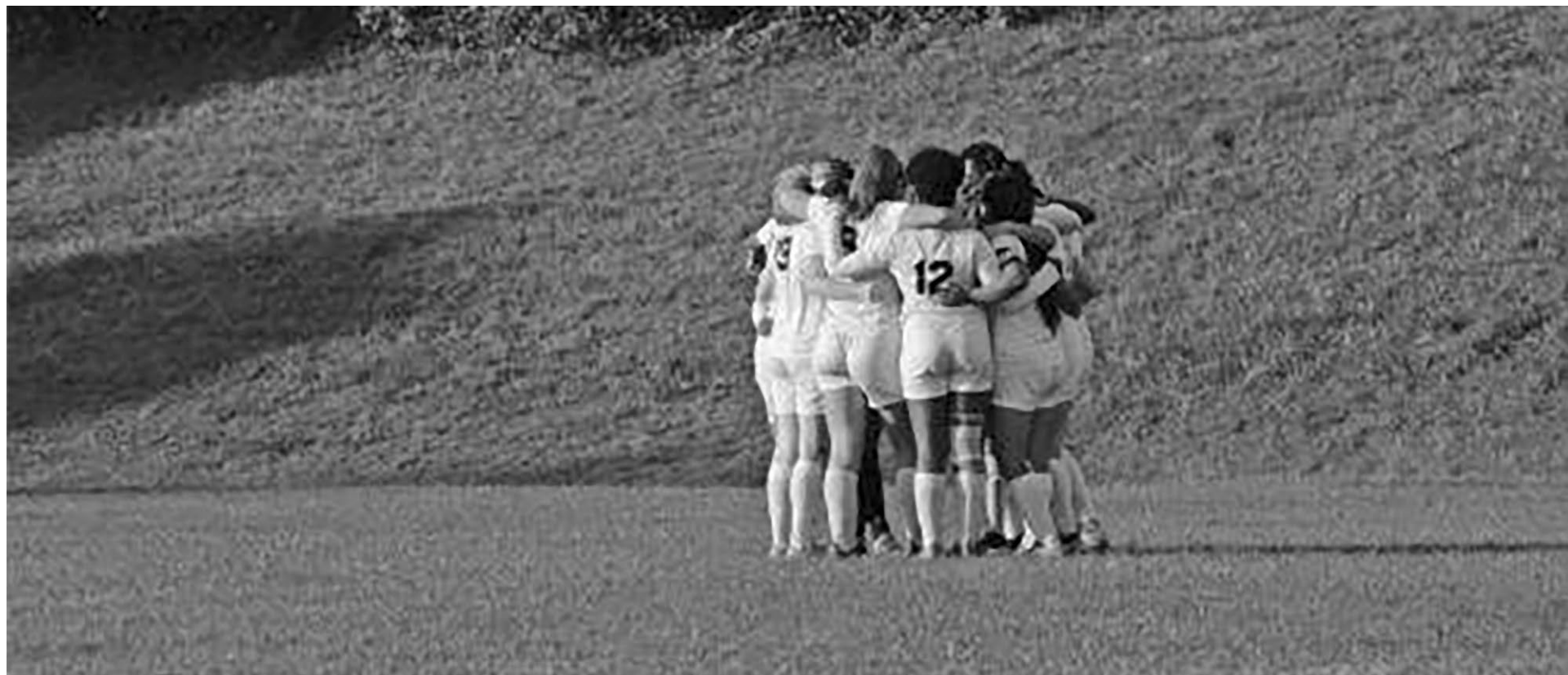
The Panthers gather around for a last talk before the start of the game.