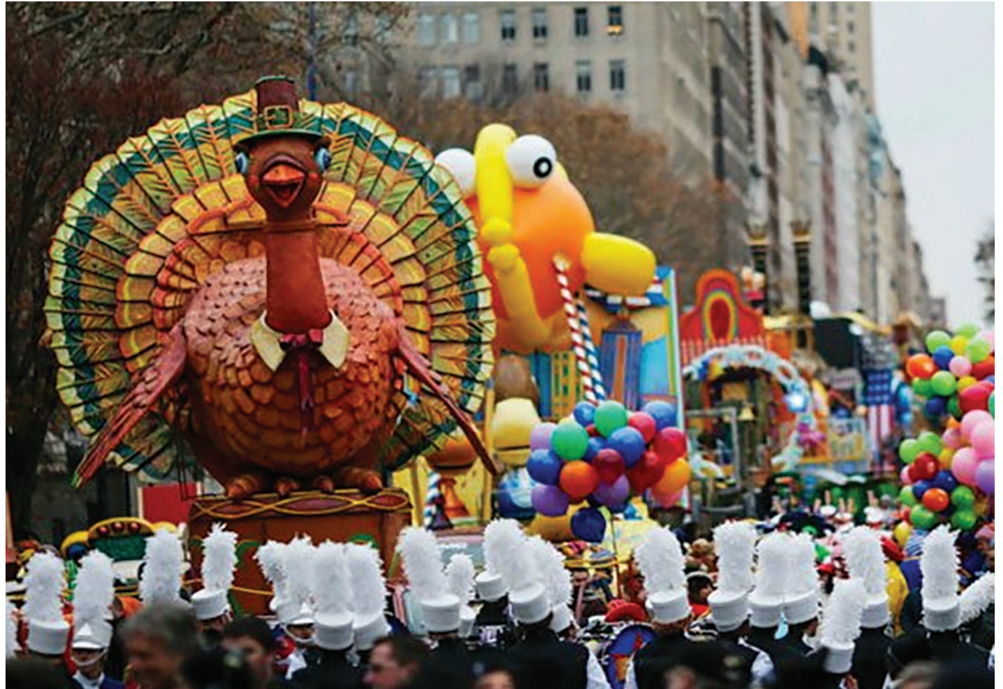
Macy's annual Thanksgiving Day parade

On another note, if you're feelings artsy and want to have arts and crafts with the family, Etsy might be the right fit for you! With their hand crafted pieces and their unique items, you and your entire family will